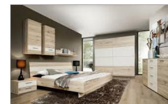
OSNOVA III SPRATA